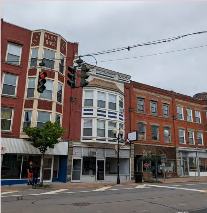
Image Key Existing conditions of exterior facades in Johnson City.

Construction should start within two years after receiving the DRI award.